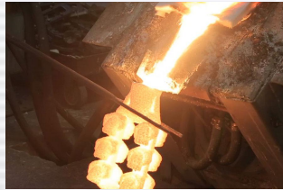
Molten Metal Pouring